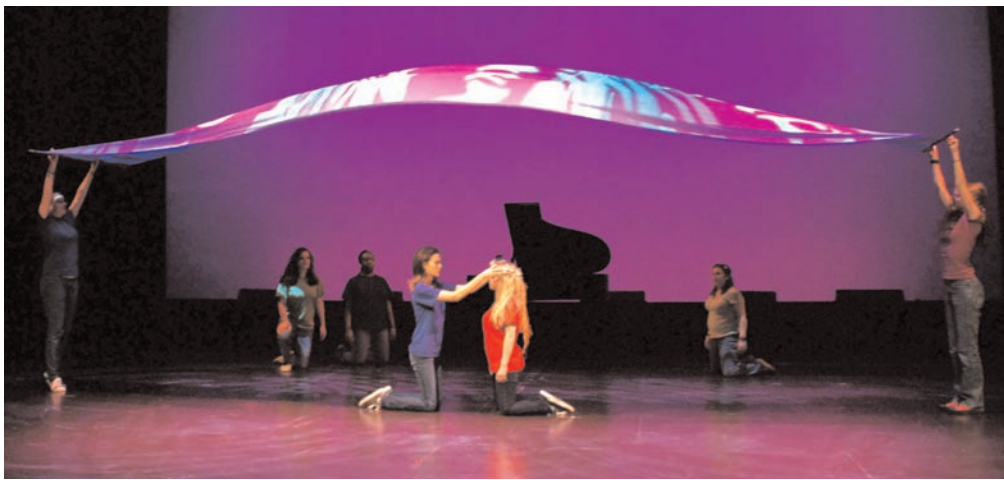
Photos from Summer Academy 2009 Showcase

The theme of this summer's program is contemporary theatre. The program will culminate in a showcase of the students' work, on Geva's Mainstage, which is open to the public. Students will be granted a certificate of completion from the Summer Academy 2010 program.