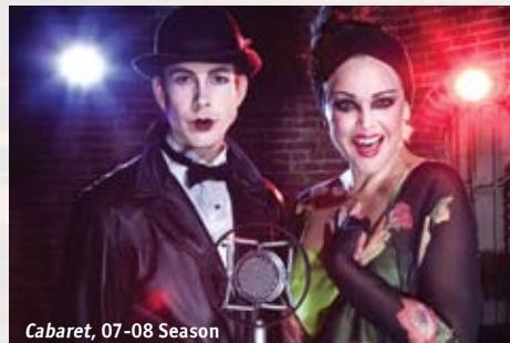
Cabaret, 07-08 Season

Anything can happen at a Preview! Before a show officially opens for reviews, we polish it to perfection. Things change – sometimes because of your reaction – and you become part of the performance process. Tickets for Previews are less expensive, offering you great live theatre and a one-of-a-kind experience at a discount!