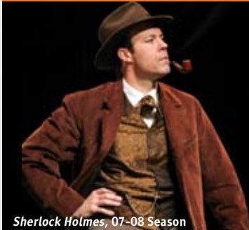
Sherlock Holmes, 07-08 Season

To add on, check the box on your order form!